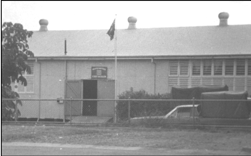
Albion Training Depot and the location of HQ CRAAOC, at McDonald Rd Albion from July 1948 until February 1963.

swelled by a wave of new conscripts. A great deal of forward planning became necessary.